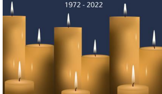
Table Talk This Morning