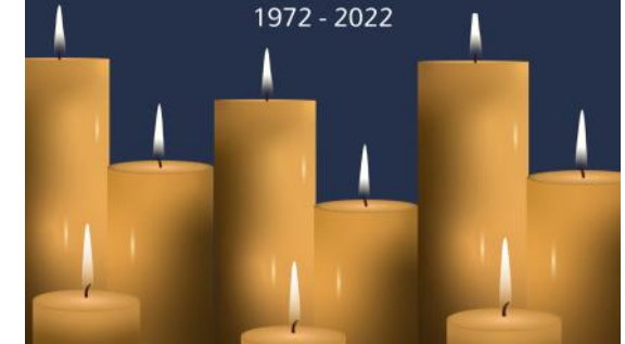
Table Talk This Morning