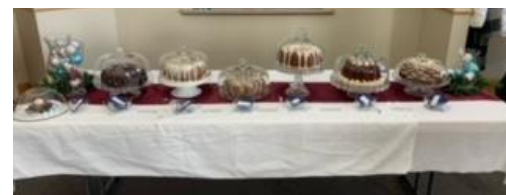
Bundt cake display Dec. 2

Sunday School resumes for PreK through 1st grade on Sunday, January 14th, at 10:10 a.m.