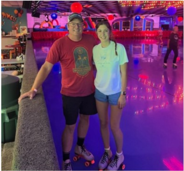
H2O, the senior high youth group at Living Waters, visited the Skatin' Place in St. Cloud on July 27. Youth from grades 8-12 and chaperones enjoyed pizza and open skate night.